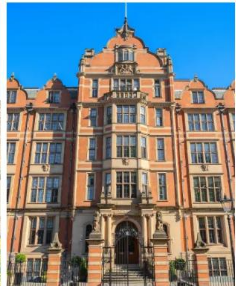
The Russell Group’s 24 university members are world-class, research-intensive universities.

Sixth Form students at Oryx International School, should be incredibly proud of themselves this year, thanks to the quality of University Offers that they are receiving.